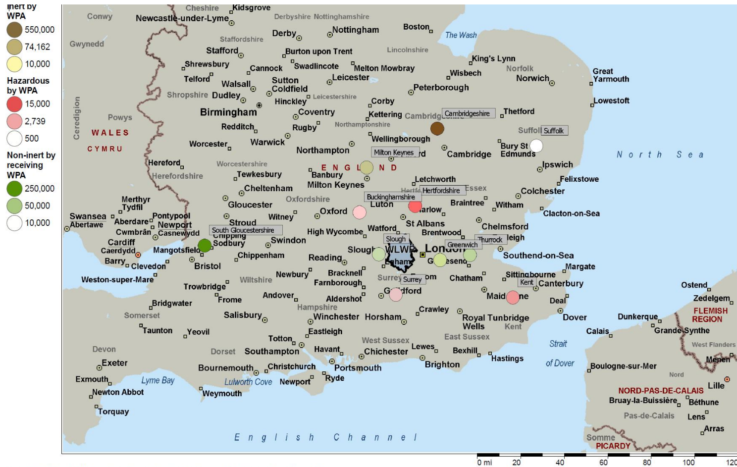
Figure 2: Significant Waste Flows from West London in 2023 by receiving WPA and principal waste type - London & wider South East (tonnes)